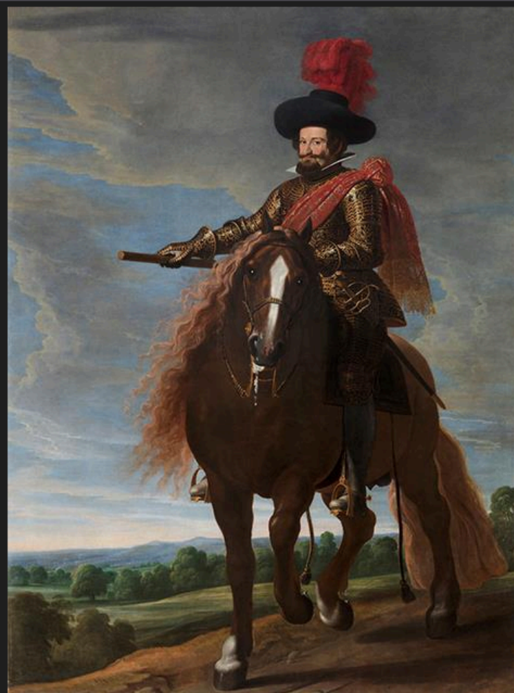
The Weiss Gallery: Gaspar de Crayer (1584 – 1669) with the landscape by Pieter Snayers (1592 – 1667), Gaspar de Guzmán, Count of Olivares and Duke of San Lúcar la Mayor, Grandee of Spain (1587 – 1645), on horseback in a landscape setting Oil on canvas: 133 ¼ x 83 ½ in. (288 x 212 cm.) Painted circa 1627 – 1628